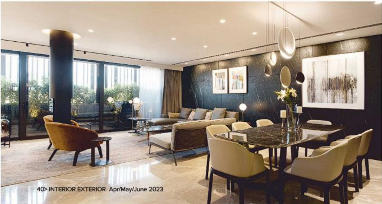
4Q> INTERIOR EXTERIOR Apr/May/June 2023

The design makes use of high-end products and bespoke furnishings. Immersive decor pieces placed in the subtle interior reflect the vibe of the house. This elegant house grants a distinguished vibe through the walls fabricated in small portions of Pigmento Grey Zinc, with moldings creating a monolithic impression for the facade. Geometric volumes of wooden finished louvers and glazing perforate this block which seems like a cut out of a dark dense mass of material. The depressed cladding pieces provide a subtle shadow effect in the façade, revealing beautifully under the sun. Thus, in a noisy natural setting, the dwelling embraces an efficient future of the contemporary language.